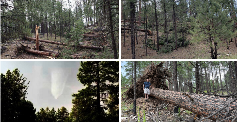
Tornado, July 10, 2021

While we may not see them as often as other parts of the country, tornadoes do happen in Arizona. In fact, the state averages about four tornadoes a year, according to information from the National Weather Service.