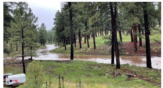
Flash Flooding, July 23, 2021

A special thank you to Bobby Reddell, Lot 53, for suggesting this article. Feedback and suggestions are always welcome.